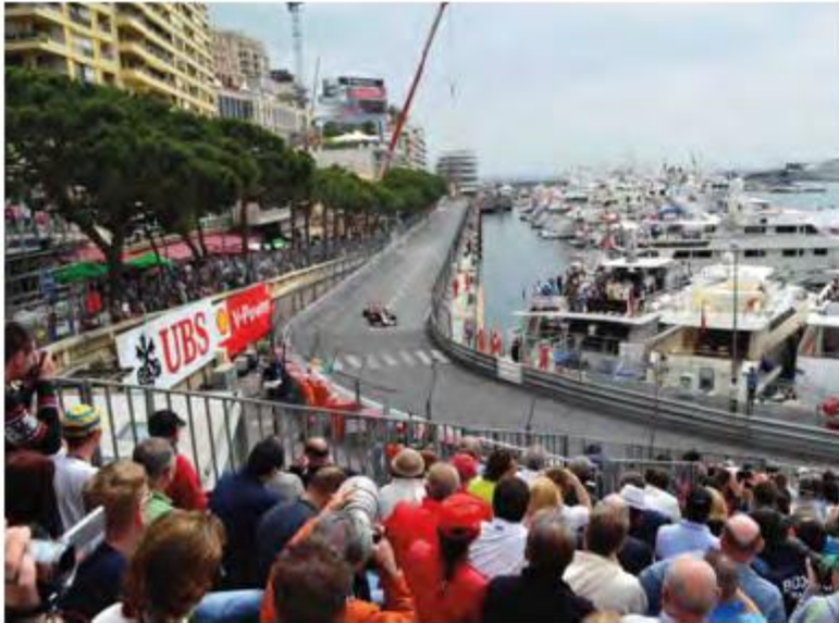
GRANDSTAND K Port Area