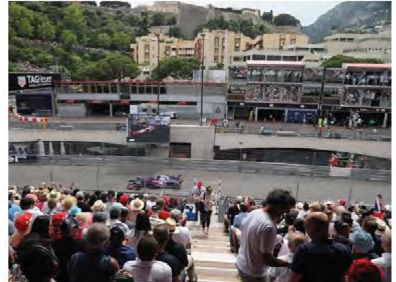
GRANDSTAND T In front of the Pit Lane

Prezzi formula week end ( Ven/Dom.) a partire da Euro 230 – 1300 Euro per persona