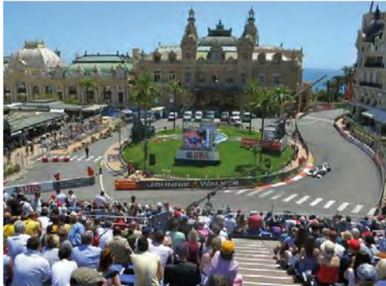
GRANDSTAND B Casino Square